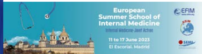
ESIM Summer School June 2023 • El Escorial, Madrid, Spain

Trainees approaching the end of their training in Internal Medicine are selected and sponsored by their national societies to attend the school. There are usually 40-50 attendees at each school with 20-25 countries represented. As a result of the school's activities since 1998, nearly 1000 trainees have passed through ESIM. They now form the basis of the growing Young Internists network being developed by the Federation across Europe.