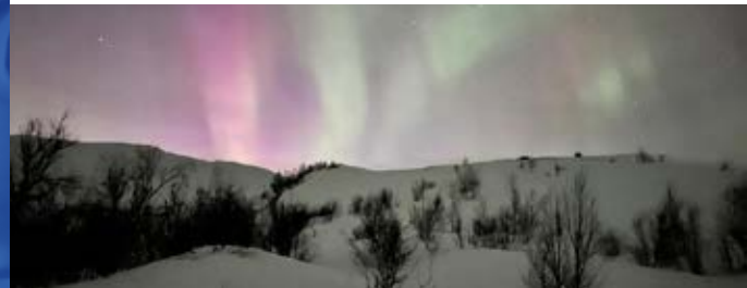
ESIM Winter School January 2024 • Björkliden, Sweden